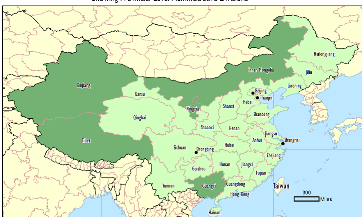
Figure 2. Map of China Showing Provincial-Level Administrative Divisions

courts, and other institutions to support local business interests and throw up barriers to players from other jurisdictions.